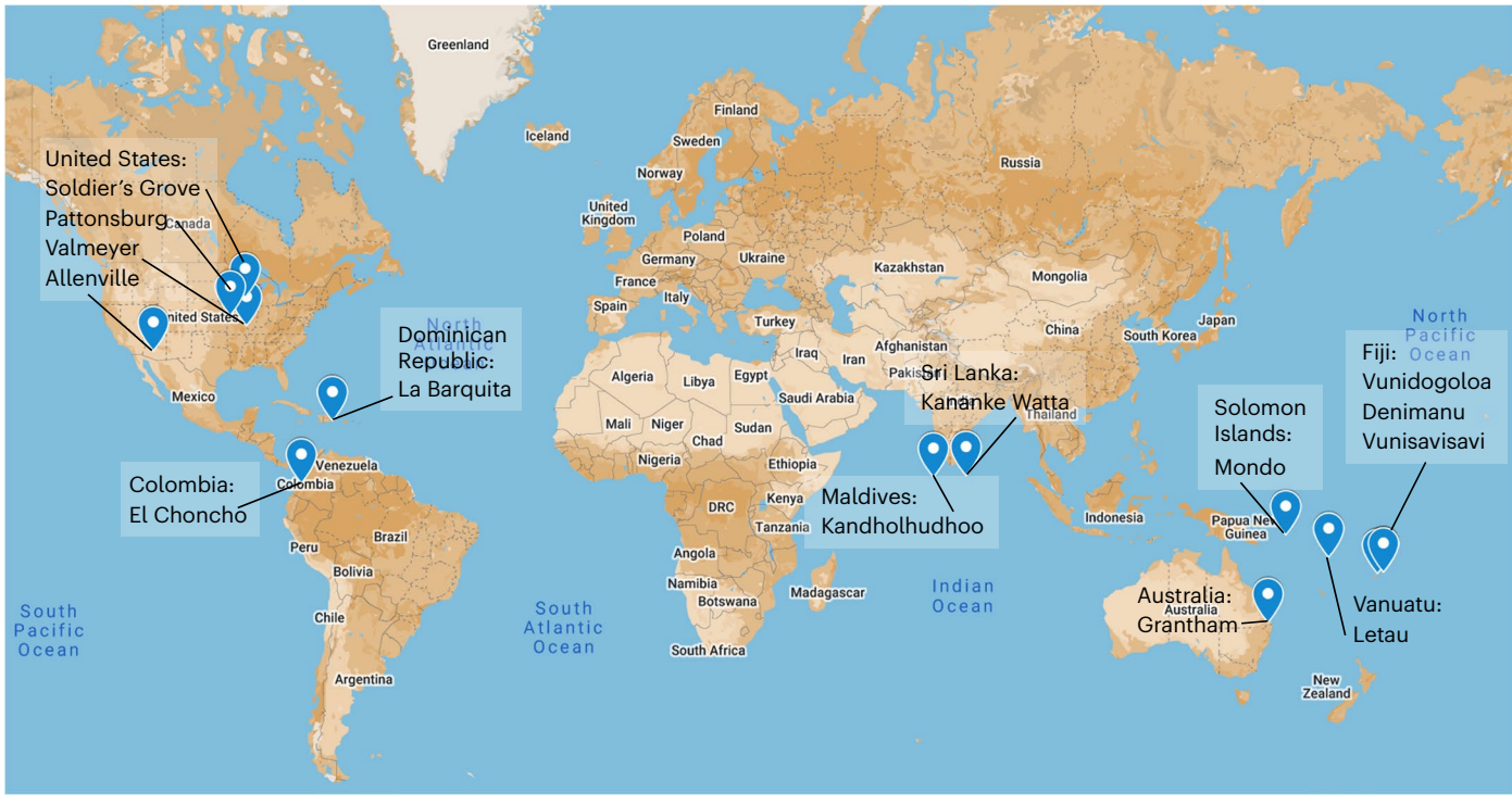
Fig. 2 | Locations of the 14 cases of flood-related planned relocation.

Further, conceptions of 'community engagement' varied across reviewed literature. While we measured the construct consistently here, this variation raises questions about who counts (for example, 'Do chiefs, mayors or local government officials count as community members?')<sup>46</sup> and existing power dynamics (for example, 'Whose voices are amplified or suppressed during decisions of whether, where and how to relocate?')<sup>47</sup>. Further, ideas of meaningful engagement varied, as not all participatory processes are equal; engagement exists along a 'spectrum' from passive information sharing to local initiative<sup>11</sup> or a 'ladder' of citizen participation with increasing 'rungs' from tokenism to control over decision-making<sup>48</sup>. Opportunities for participation also evolve over time and are required not only at initiation but also at later stages of site selection and development<sup>49</sup>. There is a tendency to treat community engagement as binary but these comparative findings paint a more multidimensional landscape. Deeper examination of community engagement is needed, including regarding inclusivity, quality and stage of the process.